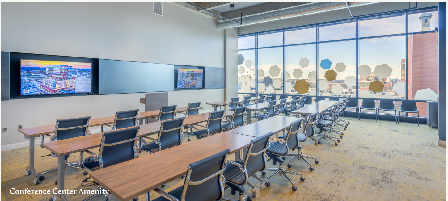
Conference Center Amenity