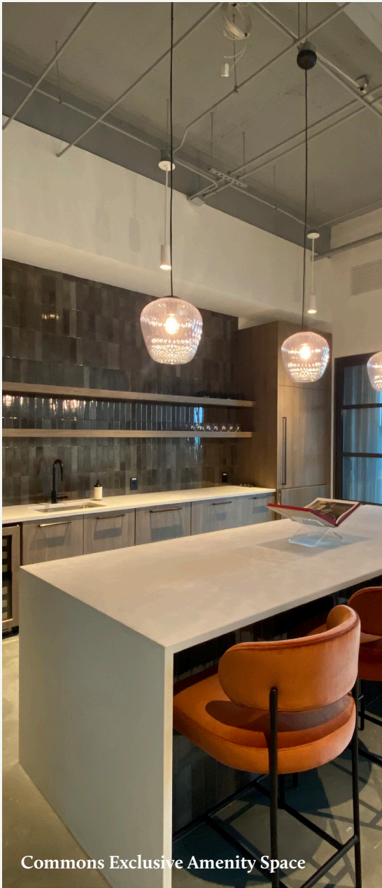
Commons Exclusive Amenity Space