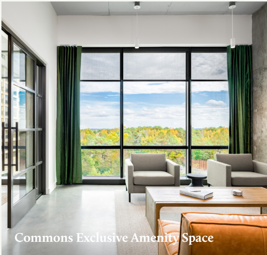
Commons Exclusive Amenity Space