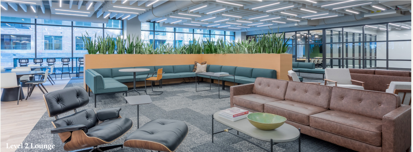
Level 2 Lounge