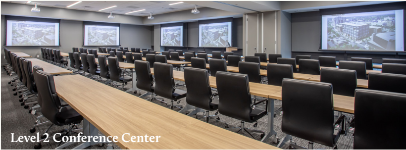
Level 2 Conference Center