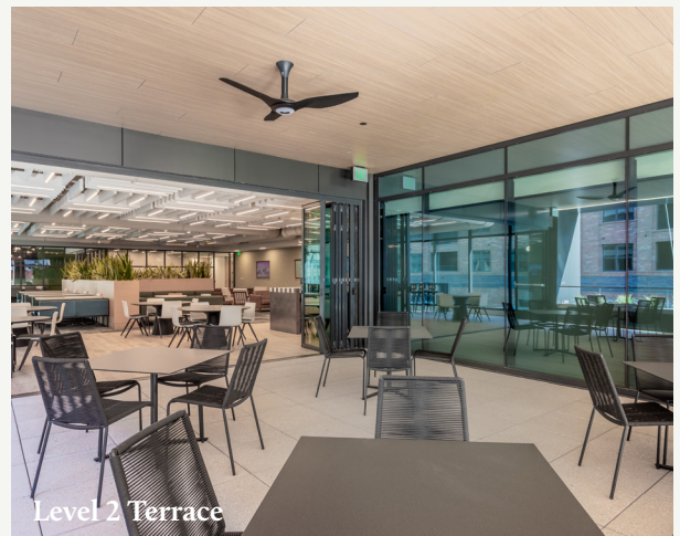
Level 2 Terrace