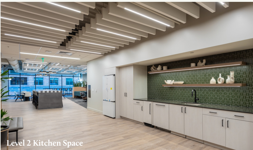
Level 2 Kitchen Space