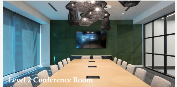
Level 2 Conference Room